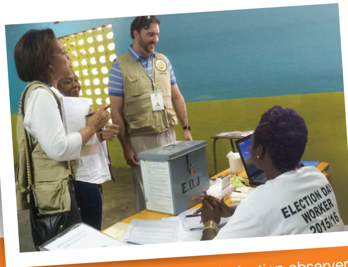
Kingston, Jamaica, 2016 - OAS election observers at a polling station, while observing the 2016 Parliamentary Election in Jamaica.