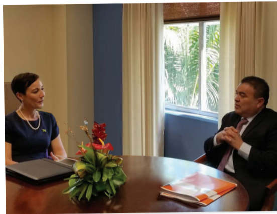
Kingston, Jamaica, 2018 - Nestor Mendez, OAS Assistant Secretary General and Senator, the Honorable Kamina Johnson Smith, Minister of Foreign Affairs and Foreign Trade of Jamaica before the activities in Jamaica to commemorate the OAS' 70th Anniversary.

"Reproduced with permission of the General Secretariat of the Organization of American States"