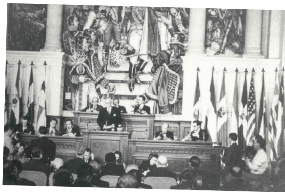
Bogota, Colombia, 1948 - Inauguration of the Ninth International Conference of American States. The OAS Charter was signed at this Conference.

Kingston, Jamaica, 1815 - While living in exile in Jamaica, Simon Bolivar wrote his famous 1815 Letter from Jamaica, in which he first expressed his vision for a unified hemisphere. The Organization of American States was eventually established to pursue Bolivar's vision of unity.